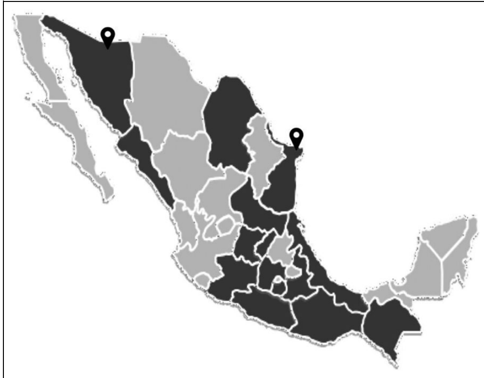
Figure 2. Locations of Data Collection Sites and Respondents' States of Origin.

Mexican UAC differently from UAC from noncontiguous states (Table 2). In addition, the existing literature on unaccompanied minors tends to overlook Mexican UAC. This study examines whether the treatment of Mexican UAC in CBP custody complies with US law and internal CBP policies, specifically with regard to (1) conditions in CBP detention facilities, (2) treatment by CBP personnel, and (3) screening for eligibility for relief. This article examines policies relevant to Mexican and Canadian UAC, as opposed to those for UAC from noncontiguous countries (see Table 2).